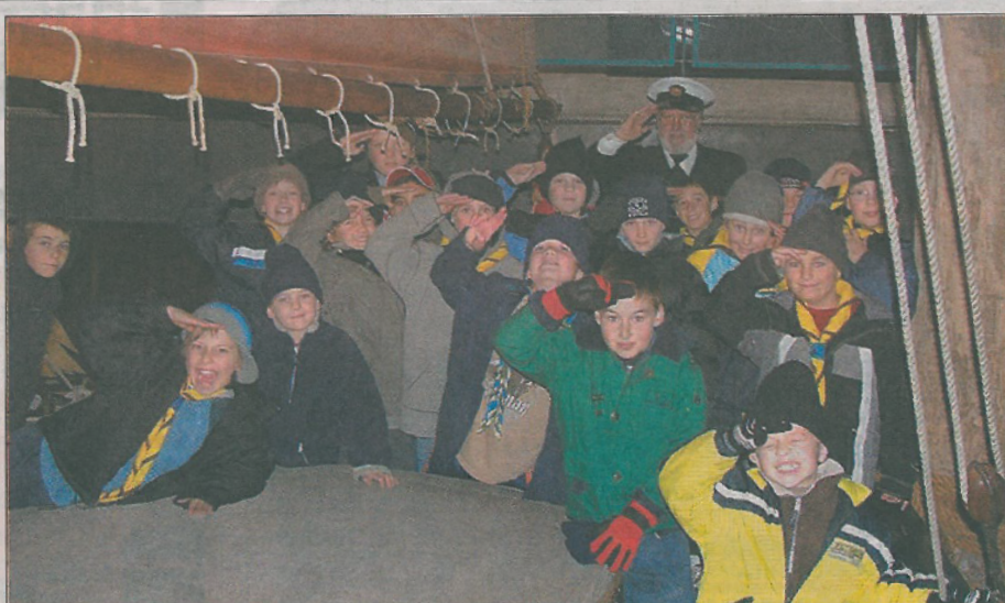
Aye aye captain: Devonport and Sunnynook Cubs on their trip to the Maritime Museum.